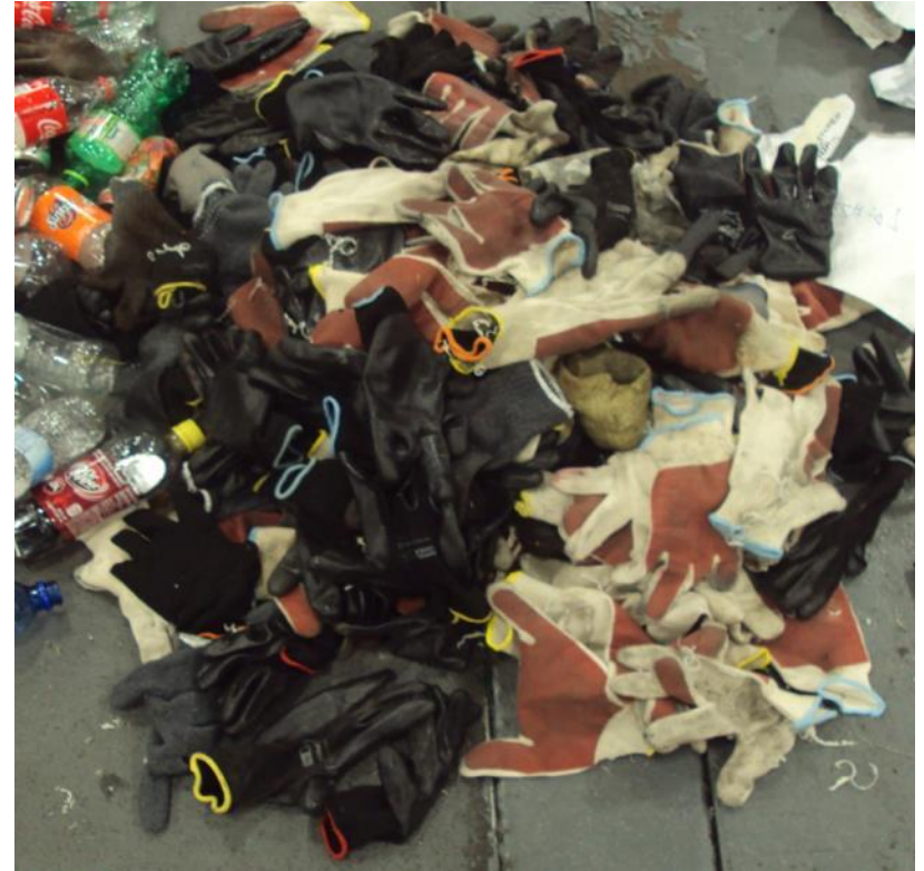
Gloves (we had a rewash program)