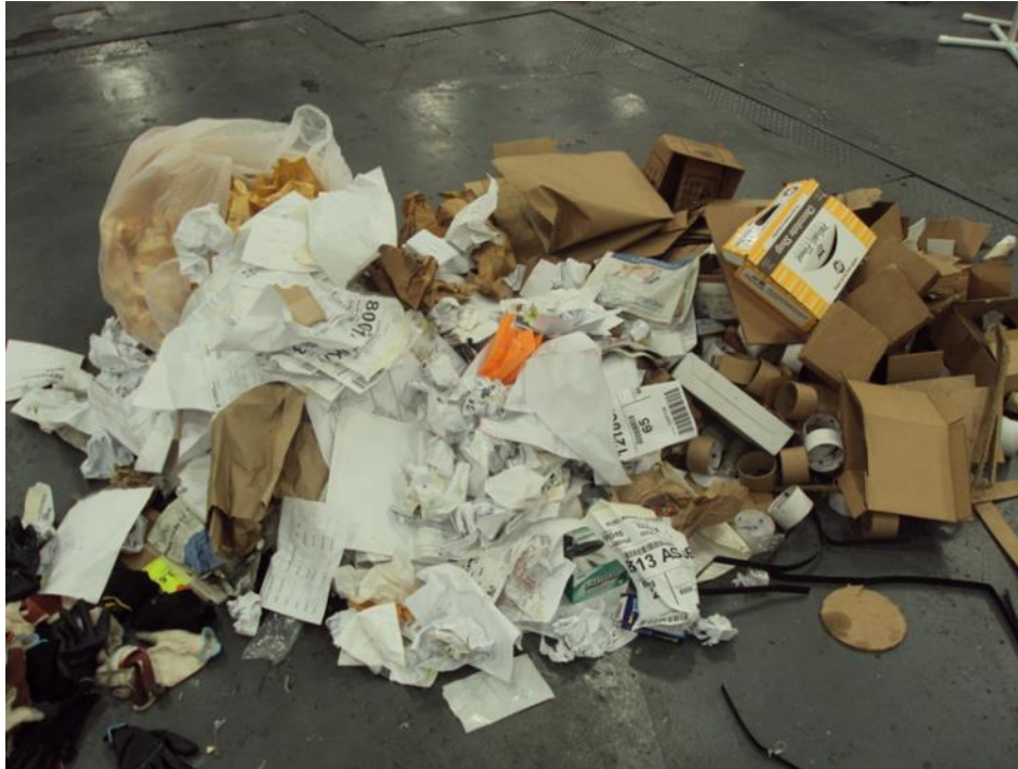
Paper and Cardboard