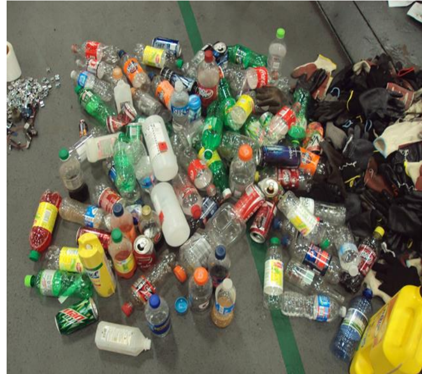
Beverage Containers - Illegal in North Carolina