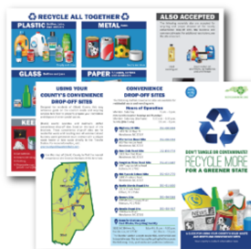
Recycling Guide Sample for a County