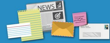
Mixed paper, white paper, glossy paper, catalogs, magazines, newspapers, envelopes and Post-It notes