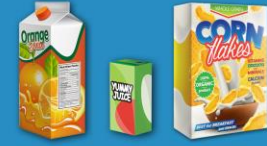
Food boxes and beverage cartons