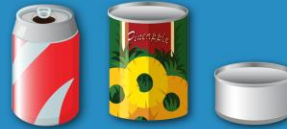
Food and beverage cans