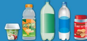
Plastic food and beverage tubs, jugs and bottles (Keep lids and caps screwed on.)

Be sure to empty out food and drink containers!