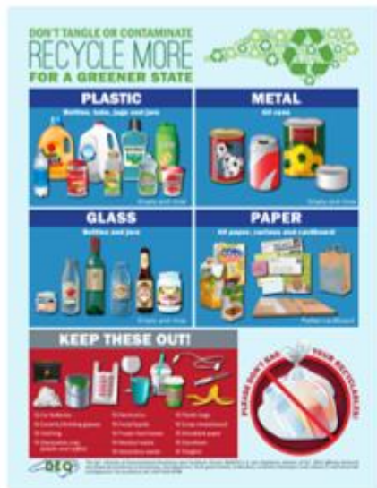
General State-wide Accepted Recyclable Materials PDF

The Division of Environmental Assistance and Customer Service (DEACS) has developed recycling outreach materials. Local governments, recycling haulers and other North Carolina organizations are encouraged to use and share these resources to help educate the public and fight contamination. Visit the Customized Outreach Materials page to view additional materials that the DEACS staff can assist in tailoring to fit your community's recycling program.