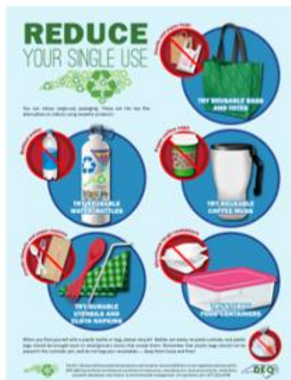
Reduce Your Single Use PDF