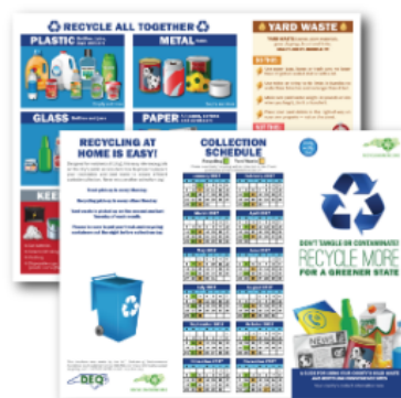
Recycling Guide Sample for a City