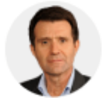
David Shukman Science editor