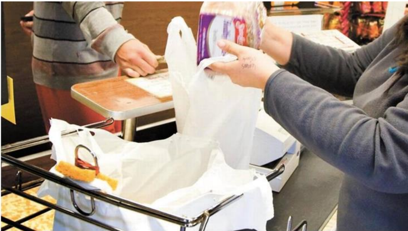
Groceries loaded into plastic bags.

FOLLY BEACH, S.C. — Another South Carolina beach community is banning plastic bags in a move that advocates say v