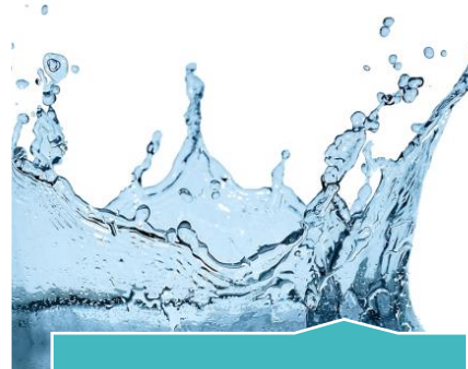
Air & Water