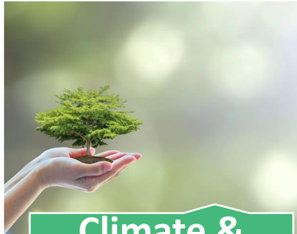
Climate & Health