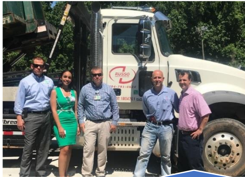
C&D Recycling Pilot