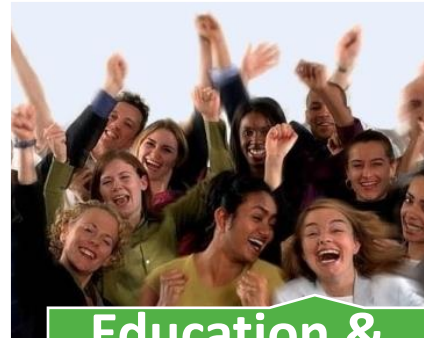
Education & Engagement