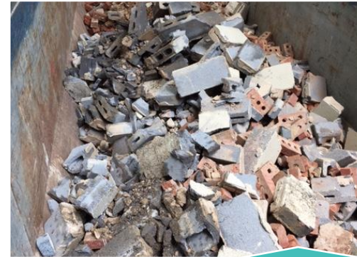
Mercy Exterior Renovation Project