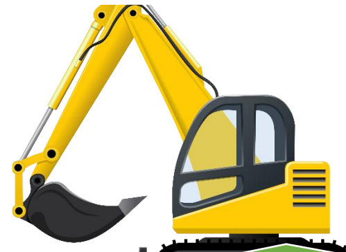
Union Hospital Project Recycling