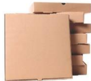
Cardboard boxes – including snack, meal and glove boxes