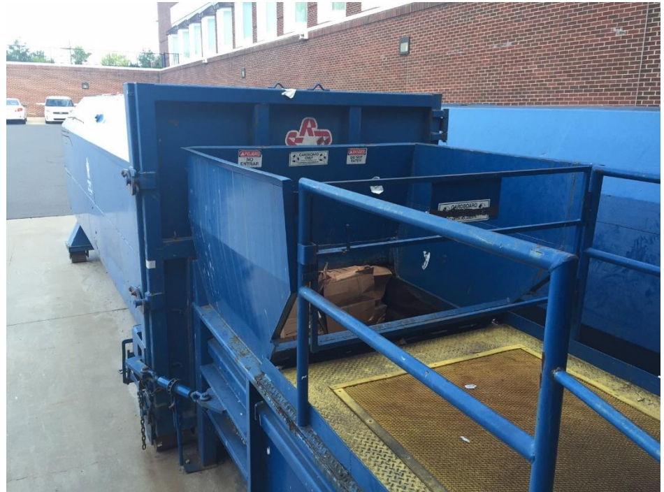
Exterior collection in cardboard compactor