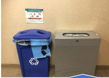
Recycling & Waste Reduction