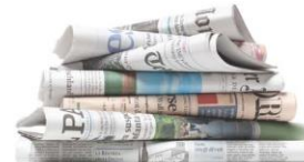
Newspaper and magazines No patient information, place in paper shred bin.