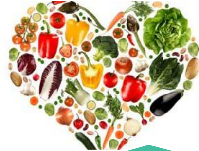
Sustainable Food Systems