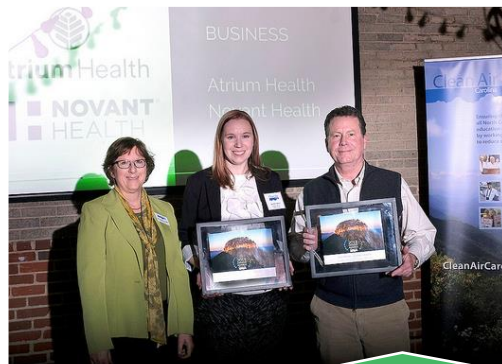
Clean Construction Partnership