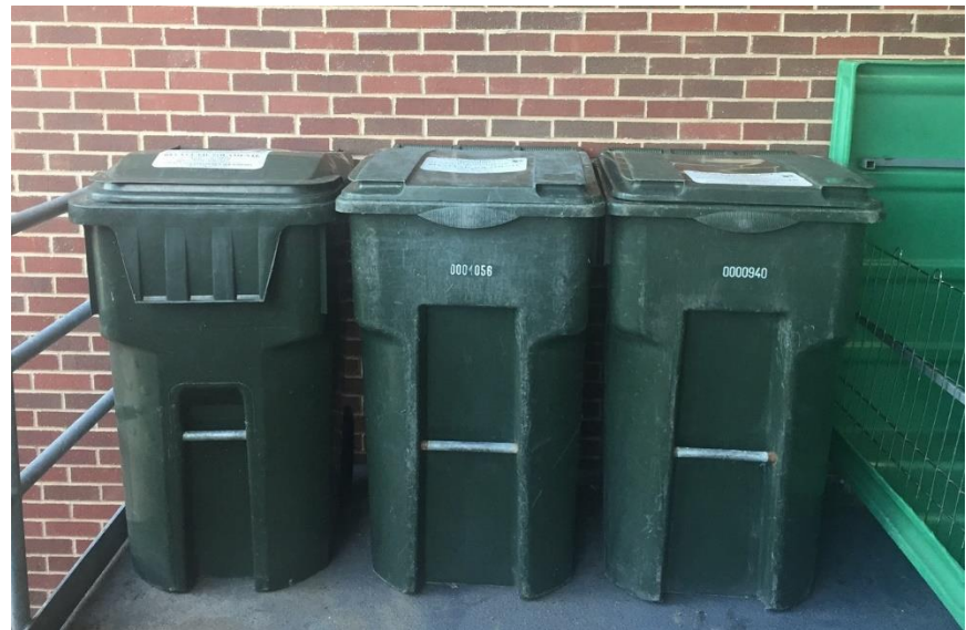
Exterior collection to gauge volume