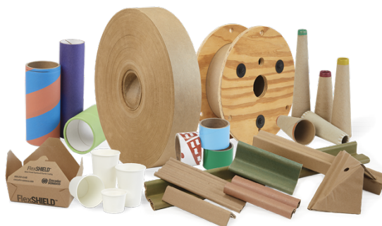
INDUSTRIAL PAPER PACKAGING